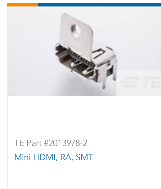
TE Part #2013978-2 Mini HDMI, RA, SMT