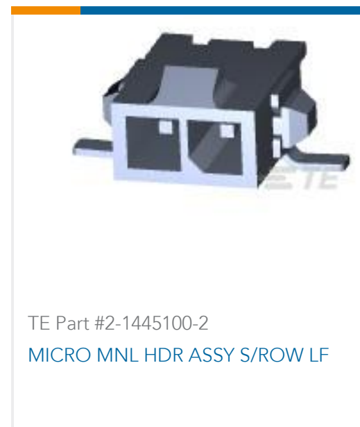
TE Part #2-1445100-2 MICRO MNL HDR ASSY S/ROW LF