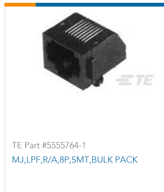
TE Part #5555764-1 MJ,LPF,R/A,8P,SMT,BULK PACK