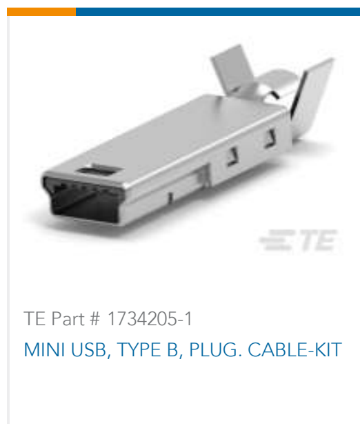
TE Part # 1734205-1 MINI USB, TYPE B, PLUG. CABLE-KIT