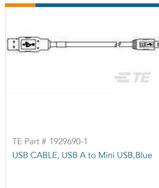
TE Part # 1929690-1 USB CABLE, USB A to Mini USB,Blue