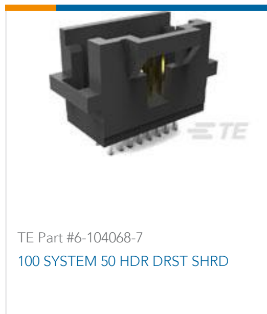
TE Part #6-104068-7 100 SYSTEM 50 HDR DRST SHRD