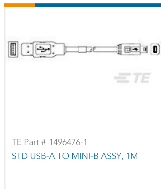
TE Part # 1496476-1 STD USB-A TO MINI-B ASSY, 1M