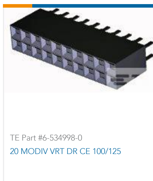
TE Part #6-534998-0 20 MODIV VRT DR CE 100/125