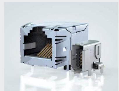
70 % reduced size compared to RJ45