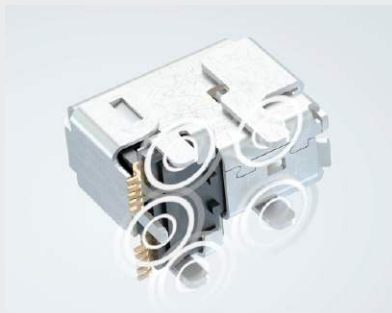
Robust receptacle with five THR shield contacts

The HARTING ix Industrial® is our answer to the future challenges posed by Industry 4.0 and the IoT. Successful miniaturisation is exemplified by its small size and outstanding robustness; this makes HARTING ix Industrial® a top performer. The ix Industrial® mating profile is standardised according to IEC 61076-3-124. It has been jointly developed by the technology partners HARTING and HIROSE.