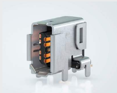
Cat 6A performance for 1/10 Gbit/s Ethernet