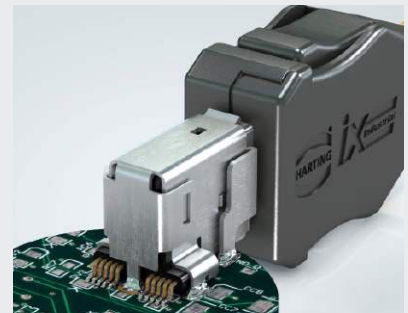
Resistant to shock and vibration, designed for 5000 mating cycles