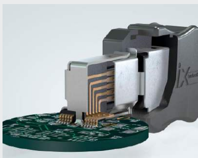
Continuous shielding and robust cable attachment