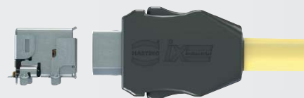
Shown in actual size

This new top performer not only takes up 70 % less space compared to RJ45, but is also much more robust. And with up to 5000 mating cycles and Cat. 6 A performance for 1/10 Gbit/s Ethernet, it establishes a benchmark for modularisation and digitisation. Standardised to IEC 61076-3-124 type A, the HARTING ix Industrial ® is a robust, miniature Ethernet interface that has potential to replace the conventional RJ45 connection. Additionally we offer a type B coded version for signal and bus systems that e.g. can replace D-Sub.