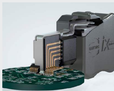
Two snap-in metal hooks ensure that the receptacle and connector are safely connected