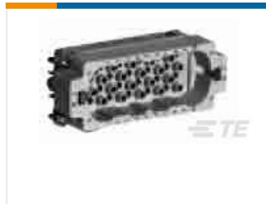
TE Part #2-1103012-3 HD.40.STI.C