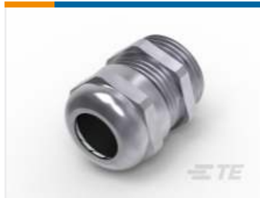
TE Part #T3609400102-000 DLX-40-M