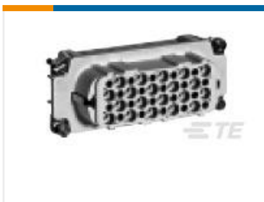
TE Part #2-1103013-3 HD.40.BU.C