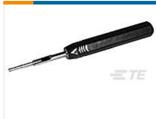
TE Part #1102855-6 EWZG-RSZ