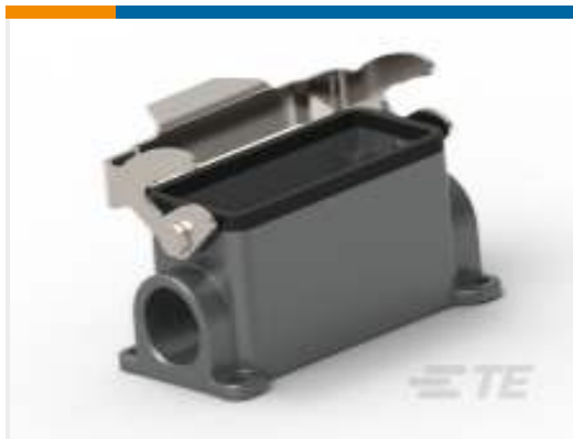
TE Part #T1610163125-000 H16B-SGR-LB-M25