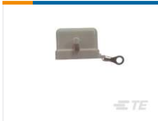
TE Part #T1010032100-000 H3A-KDBP-NY150