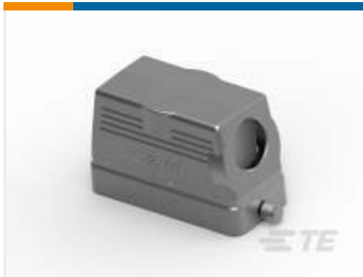
TE Part #T1310160125-000 H16B-TS-RO-M25