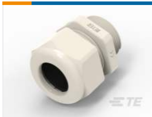
TE Part #T3209211201-000 HSK-P21G