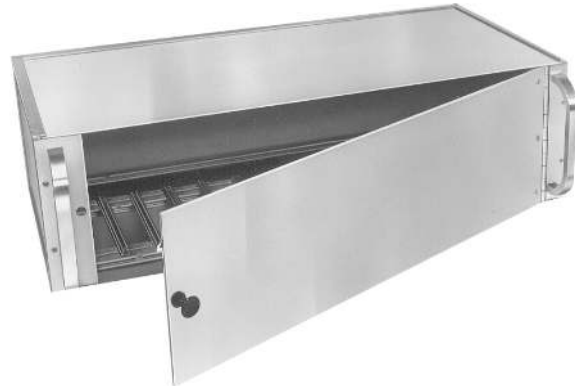
Rack with HFP52-1 Hinged Front Panel (side)