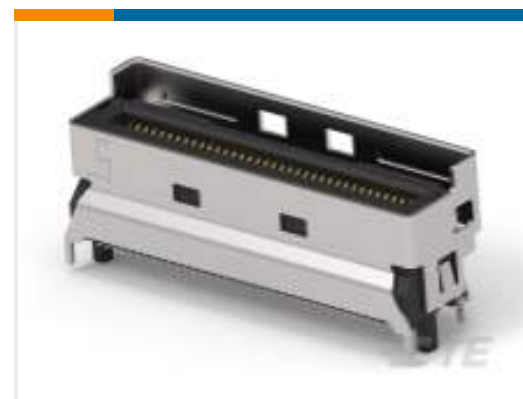
TE Part #1-2379397-5 MCIO INTERGRATED CONN, V/T,8X, SMT TYPE