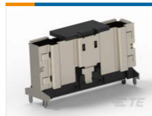
TE Part #2324787-1 RCPT CONN W RAILS VERT 74 POSN SLIVER