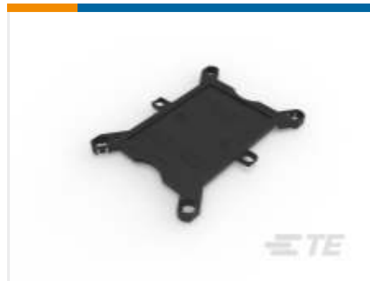
TE Part # 2305234-1 SOCKET P HARDWARE DUST COVER