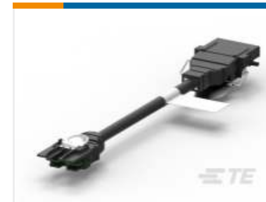
TE Part # 2821722-4 IFP/LEC CBL ASSY 1 PORT TYPE B STR INV