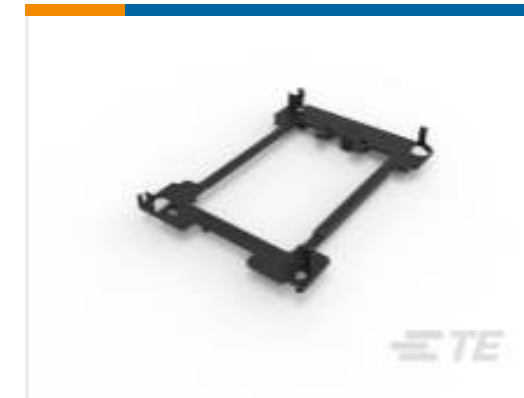
TE Part # 2310927-1 CARRIER, NARROW FABRIC, SOCKET P