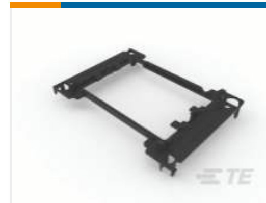
TE Part # 2299806-1 NRW NON-FABRIC CARRIER, SOCKET P0