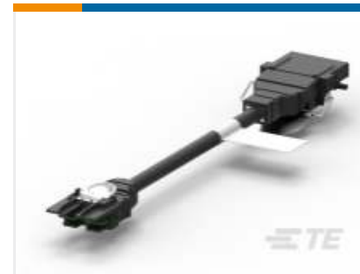
TE Part # 2821722-3 IFP/LEC CBL ASSY 1 PORT TYPE B STR INV