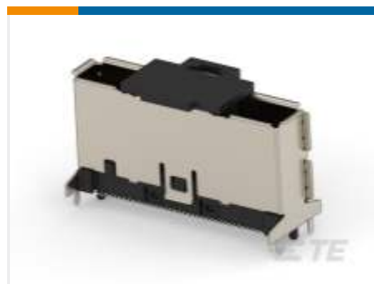
TE Part #2291316-1 RCPT CONN VERTICAL 74 POSN SLIVER