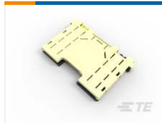
TE Part # 2-2129710-6 RIGHT SIDE LGA3647-0 SOCKET-P0 FOR ODM