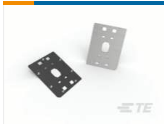
TE Part # CAT-L59017-A76H LGA 3647 Socket Hardware