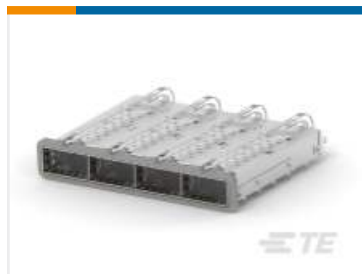
TE Part #2170784-3 CAGE ASSY, 1X4, QSFP28, GASKET, 1LP