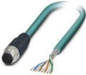
Assembled Ethernet cable, shielded, 4-pair, AWG 26 stranded (7-wire), RAL 5021 (sea blue), M12 plug to free cable end, line, length 5 m

Please be informed that the data shown in this PDF Document is generated from our Online Catalog. Please find the complete data in the user's documentation. Our General Terms of Use for Downloads are valid ( http://download.phoenixcontact.com )