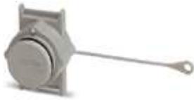
Protective cover, IP67, tall design, irradiated for welding applications

Please be informed that the data shown in this PDF Document is generated from our Online Catalog. Please find the complete data in the user's documentation. Our General Terms of Use for Downloads are valid ( http://download.phoenixcontact.com )