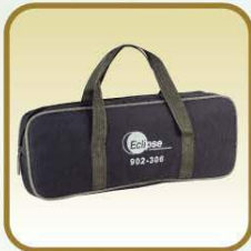
Packaged with a bag