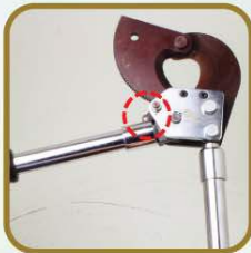
Ratchet release design