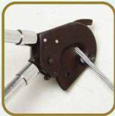
Ideal cutting capability