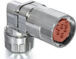
Contact Arrangement mating view

C SD A 481 NN 00 45 0030 000 C U A 481 N 00 45 0030 000