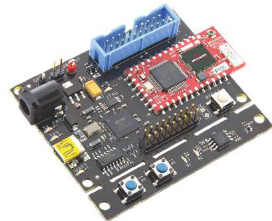
The BCM943362WCD4 WICED module mounted on a full-featured evaluation and development board.