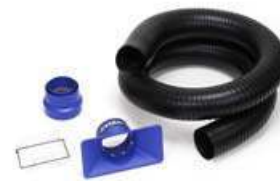
C1571 Duct Kit