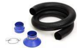
C1572 Duct Kit