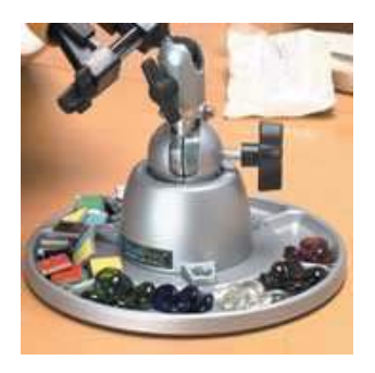
Click on any of the above images to find out more about the products pictured.