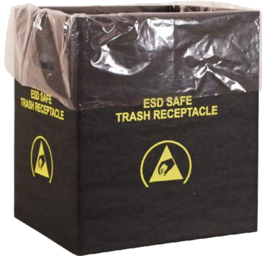
Trash receptacle with liner Receptacle sold separately