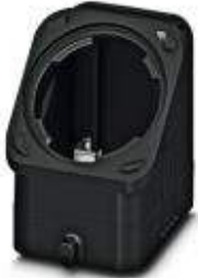
HEAVYCON EVO sleeve housing, plastic, with bayonet flange for EVO screw connection, B6, for single locking latch, height: 60.5 mm, without EVO screw connection

Please be informed that the data shown in this PDF Document is generated from our Online Catalog. Please find the complete data in the user's documentation. Our General Terms of Use for Downloads are valid ( http://download.phoenixcontact.com )