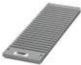
Plastic magazine for CMS-P1 plotter. Accepts 22 Zack band strips