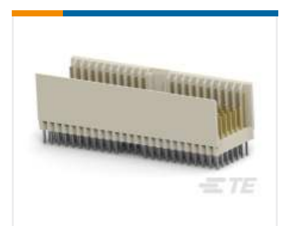
TE Part #646529-1 Z-PACK 2MM HM TYPE A/B 169P