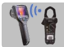
Bluetooth® METERLiNK® communication