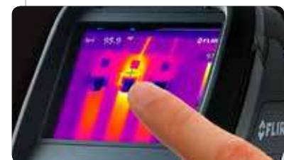
Large 3.5" touchscreen