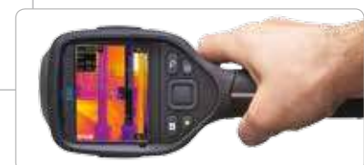
Auto-orientation keeps diagnostics overlays upright