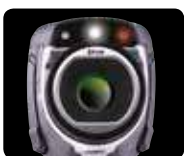
Visible light pictures align with thermal images: 3.1MP digital camera, LED lamp, and laser pointer