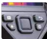
Large buttons for easy glove-handed operation