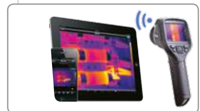
FLIR Tools Mobile Wi-Fi connectivity