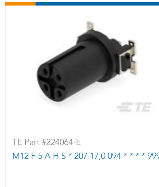
TE Part #224064-E M12 F 5 A H S * 207 17,0 094 * * * * 999