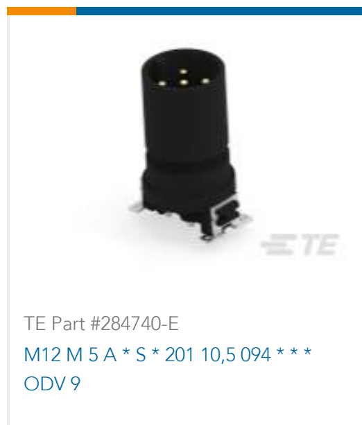
TE Part #284740-E M12 M 5 A * S * 201 10,5 094 * * * ODV 9