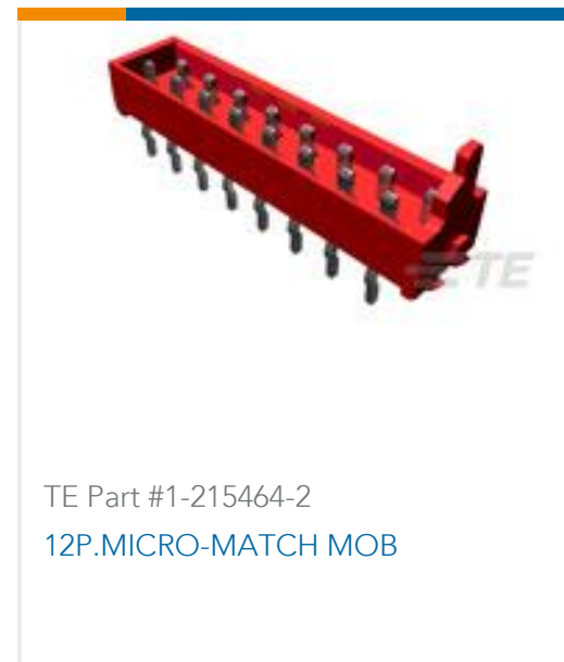
TE Part #1-215464-2 12P.MICRO-MATCH MOB