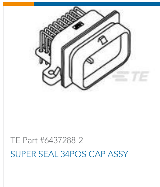
TE Part #6437288-2 SUPER SEAL 34POS CAP ASSY