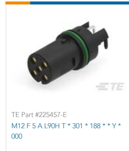
TE Part #225457-E M12 F 5 A L90H T * 301 * 188 * * * Y * 000