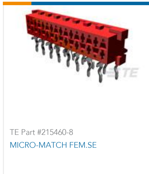
TE Part #215460-8 MICRO-MATCH FEM.SE