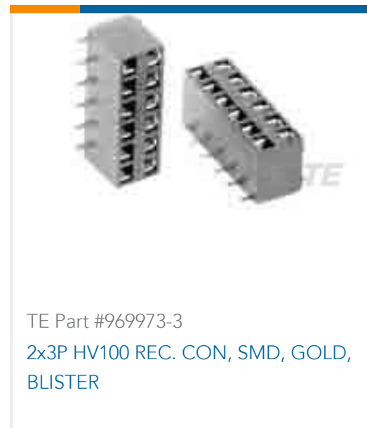
TE Part #969973-3 2x3P HV100 REC. CON, SMD, GOLD, BLISTER