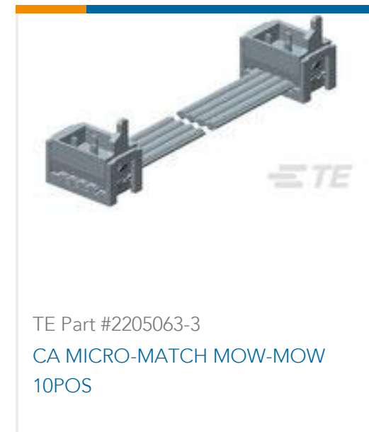
TE Part #2205063-3 CA MICRO-MATCH MOW-MOW 10POS