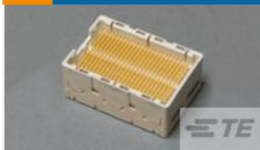
TE Part # 6-1761614-5 STEP-Z PLUG 15MM 200P LF ST