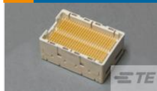
TE Part # 6-2007614-5 STEP-Z PLUG 15MM 200P LF HT