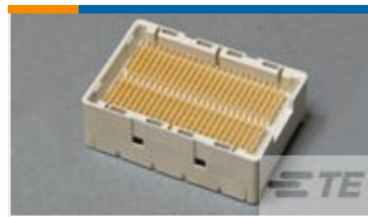
TE Part # 6-1761614-3 STEP-Z PLUG 13MM 200P LF ST