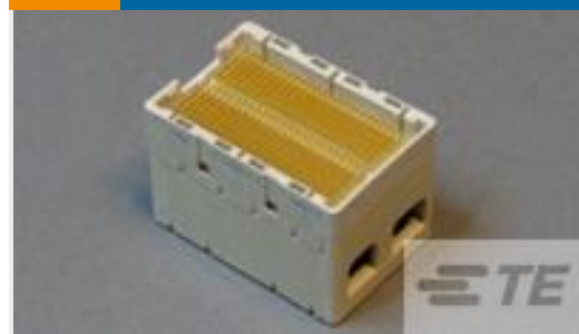
TE Part # 7-1761614-5 STEP-Z PLUG 25MM 200P LF ST