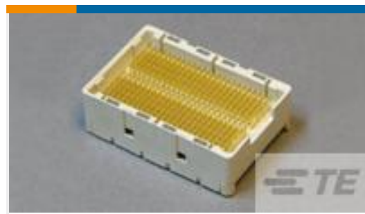
TE Part # 6-1761614-2 STEP-Z PLUG 12MM 200P LF ST