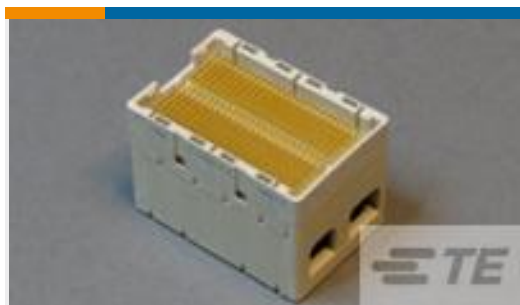
TE Part # 7-2007614-5 STEP-Z PLUG 25MM 200P LF HT