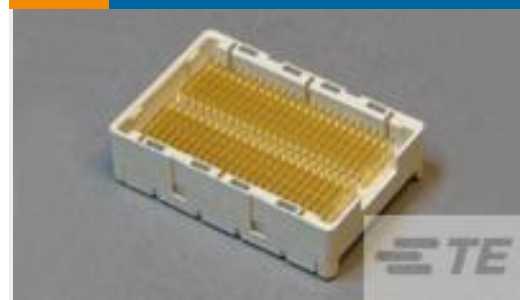
TE Part # 6-2007614-0 STEP-Z PLUG 10MM 200P LF HT