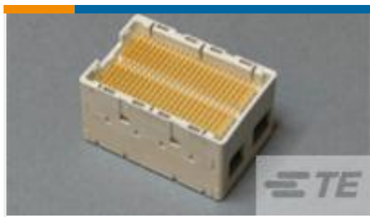
TE Part # 7-1761614-0 STEP-Z PLUG 20MM 200P LF ST