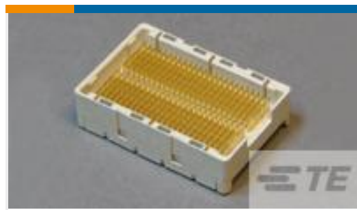
TE Part # 6-1761614-0 STEP-Z PLUG 10MM 200P LF ST