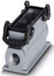
HEAVYCON box mounting base B24, with double locking latch, height 68 mm, with supports 2xM25

Please be informed that the data shown in this PDF Document is generated from our Online Catalog. Please find the complete data in the user's documentation. Our General Terms of Use for Downloads are valid ( http://phoenixcontact.com/download )