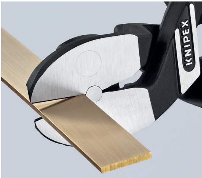
Copper busbars are cut cleanly and flush