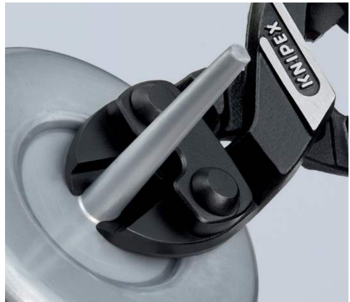
Ideal for the flush cutting of plastic sprues with large diameters