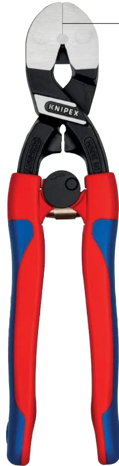
View: Back of pliers