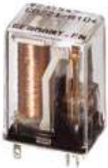
KAMMRELAIS ®, contact B 104, size 1, low-level contact, 2 PDTs, input voltage 24 V AC

Please be informed that the data shown in this PDF Document is generated from our Online Catalog. Please find the complete data in the user's documentation. Our General Terms of Use for Downloads are valid ( http://phoenixcontact.com/download )