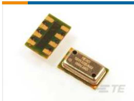
TE Part #MS560702BA03-50 MS5607-02BA SS CAP ALTIMETER T&R