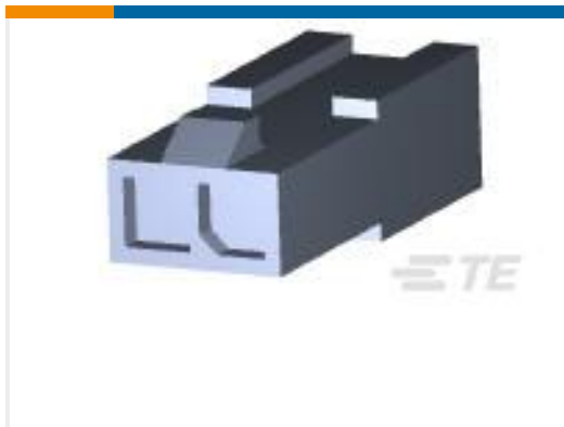
TE Part #1445049-2 FREE HANG SNGL ROW HSG 2 POS