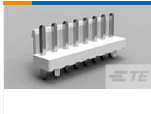
TE Part #1744057-2 3.96 EP HDR ASSY 2P W/PEGS