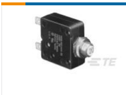
TE Part #2-1393249-8 W58-XB1A6A-20=W58