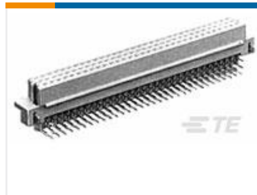
TE Part #5650895-5 ASSY, RECEPT, EUROCARD, TYPE R, LEAD-FREE, 96