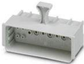
Contact insert upper part

Please be informed that the data shown in this PDF Document is generated from our Online Catalog. Please find the complete data in the user's documentation. Our General Terms of Use for Downloads are valid ( http://phoenixcontact.com/download )