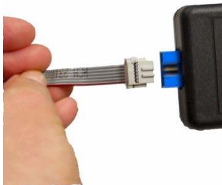
Figure 2. Connecting the Six-Conductor Ribbon Cable to the Serial or USB Smart Cable

After installing the USB Smart Cable, connect the power supply to the development board at connector J7, and then to an electrical outlet. The Green 3.3 V DC LED illuminates indicating that power is supplied to the board.