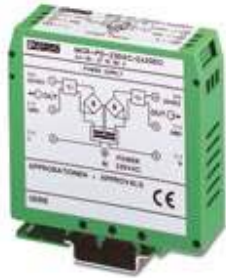
Power supply unit, with fixed-voltage regulator, input 230 V AC, output 2 x 20 V DC/2 x 25 mA

Please be informed that the data shown in this PDF Document is generated from our Online Catalog. Please find the complete data in the user's documentation. Our General Terms of Use for Downloads are valid ( http://phoenixcontact.com/download )