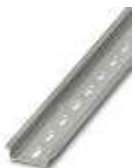
DIN rail, material: steel galvanized and passivated with a thick layer, perforated, height 7.5 mm, width 35 mm, length: 2000 mm

DIN rail perforated - NS 35/ 7,5 PERF 2000MM - 0801733