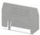
Partition plate, Length: 61 mm, Width: 2 mm, Height: 42 mm, Color: gray

DIN rail perforated - NS 35/ 7,5 PERF 2000MM - 0801733