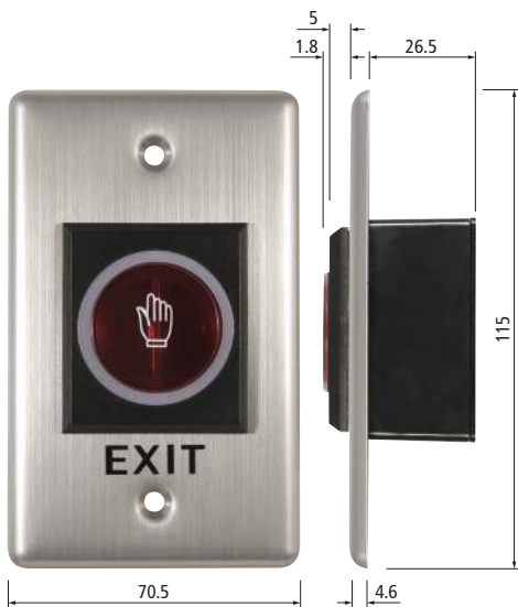
All dimensions in mm