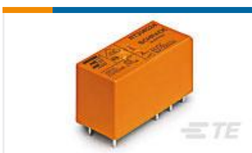
TE Part #1-1393238-9 RTB14024