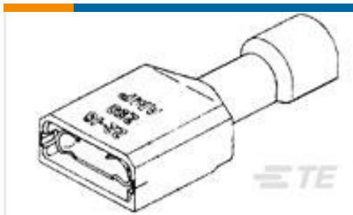
TE Part #2-520184-4 ULTRAFast 250 ASSY REC 22-18 TPBR LP