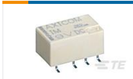
TE Part #1462041-7 IMB03CGR=IM RELAY 140mW 5V HDV