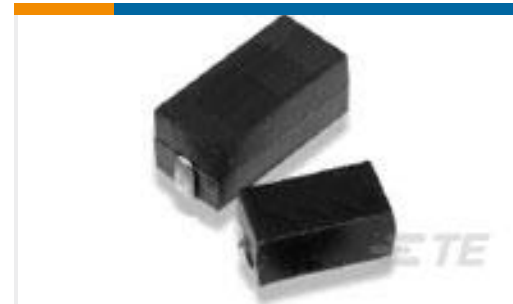
TE Part #6-1879022-9 SMF3 220K 5%