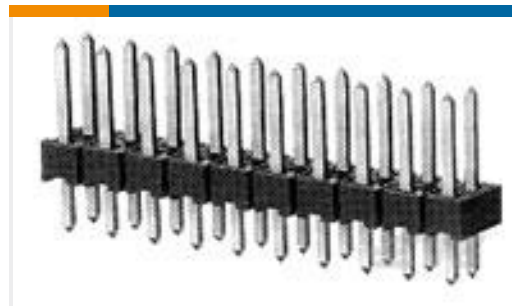
TE Part #5-146256-3 06 MODII HDR DRST B/A .100CL L