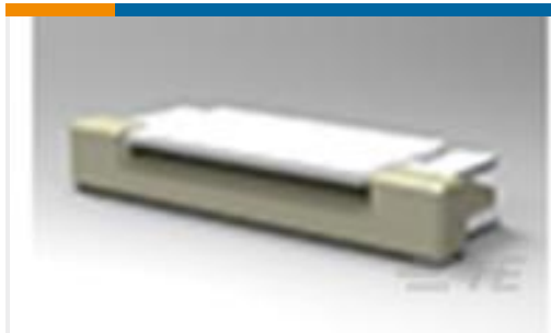
TE Part #4-1734839-0 FPC CONN. 0.5MM PITCH T/C,40P