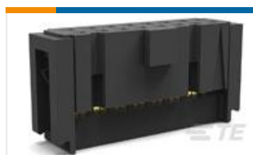
TE Part #2-1658527-8 622-3441LF=FSKT IDC S 34 30AU