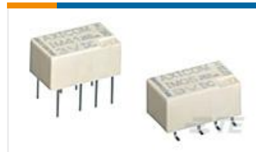
TE Part #2-1462037-2 IM05TS=IM Relay 140mW 9V