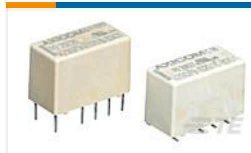
TE Part #5-1393788-7 V23079D1003B301