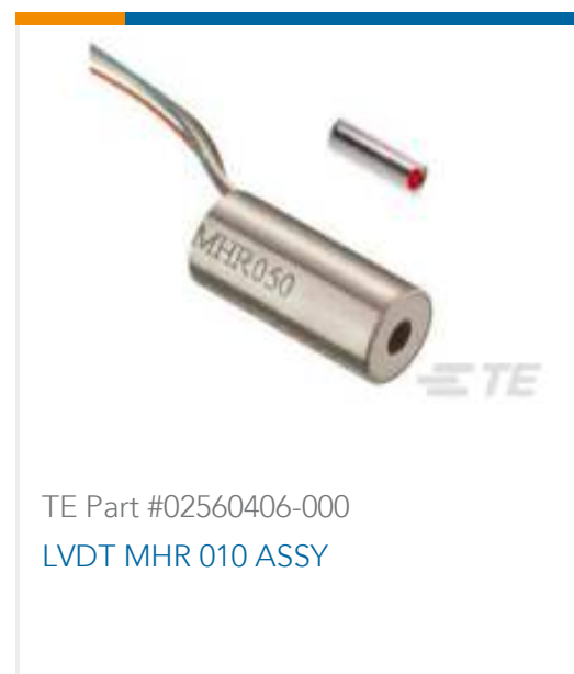
TE Part #02560406-000 LVDT MHR 010 ASSY