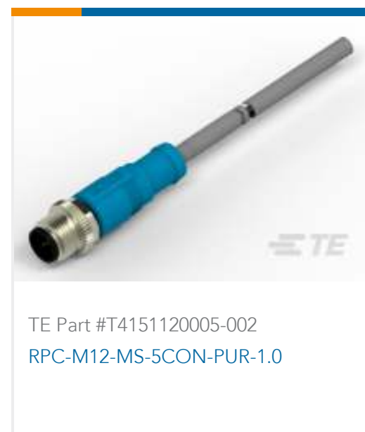
TE Part #T4151120005-002 RPC-M12-MS-5CON-PUR-1.0