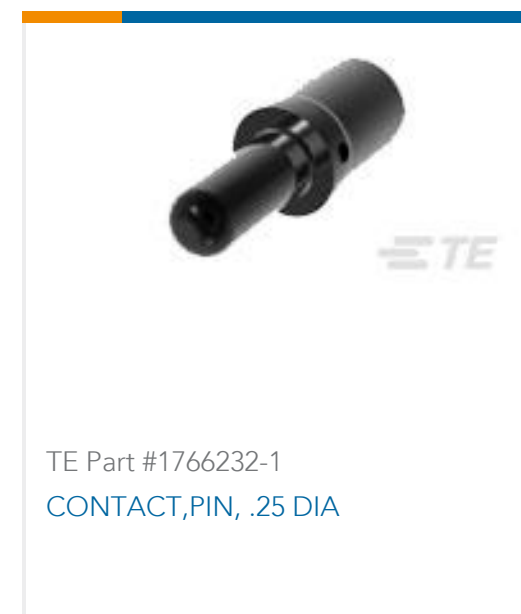
TE Part #1766232-1 CONTACT,PIN, .25 DIA