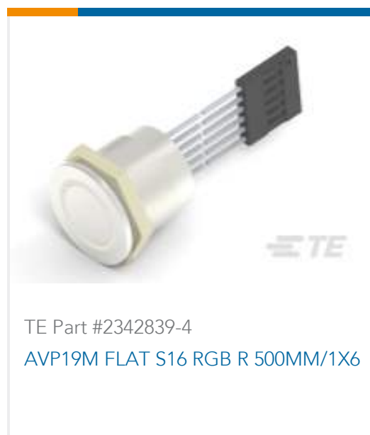
TE Part #2342839-4 AVP19M FLAT S16 RGB R 500MM/1X6