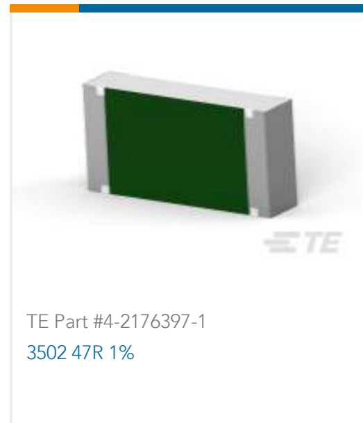
TE Part #4-2176397-1 3502 47R 1%