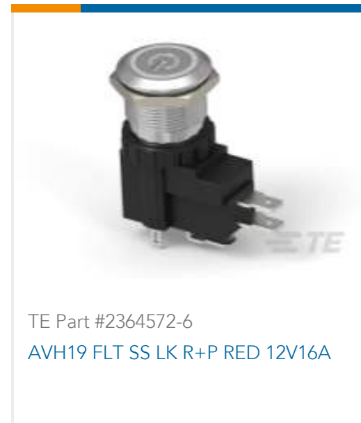
TE Part #2364572-6 AVH19 FLT SS LK R+P RED 12V16A