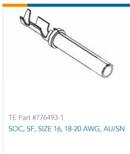
TE Part #776493-1 SOC, SF, SIZE 16, 18-20 AWG, AU/SN