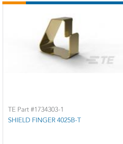
TE Part #1734303-1 SHIELD FINGER 4025B-T