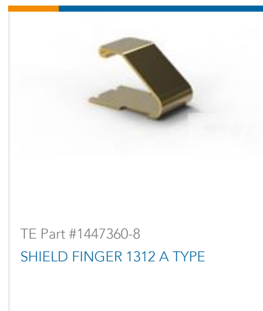
TE Part #1447360-8 SHIELD FINGER 1312 A TYPE