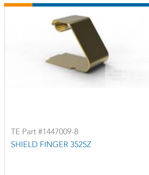
TE Part #1447009-8 SHIELD FINGER 3525Z