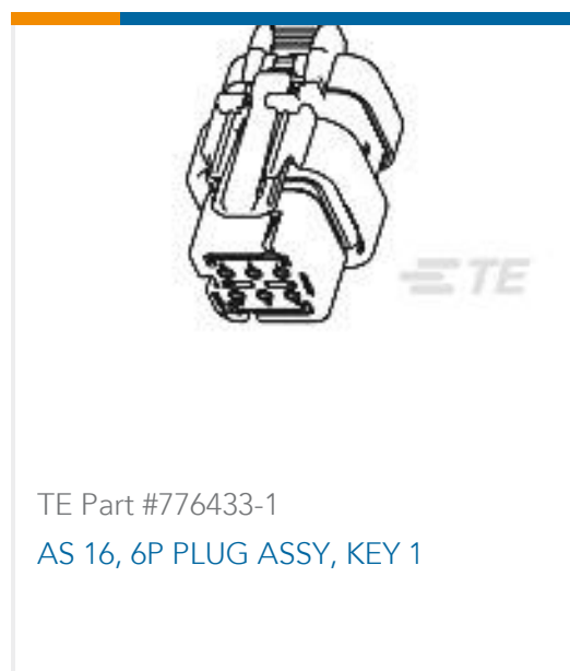
TE Part #776433-1 AS 16, 6P PLUG ASSY, KEY 1