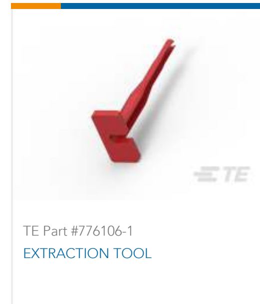
TE Part #776106-1 EXTRACTION TOOL