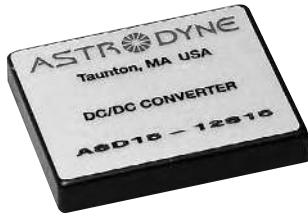
Unit measures 1.6"W x 2"L x 0.375"H