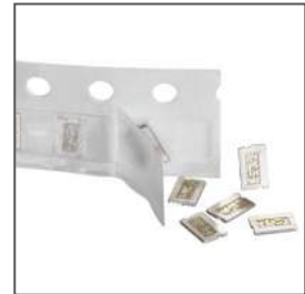
track-it™ Traceability Pad