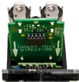
Figure 2. Q45 battery board

As with all batteries, these are a fire, explosion, and severe burn hazard. Do not burn or expose them to high temperatures. Do not recharge, crush, disassemble, or expose the contents to water. Properly dispose of used batteries according to local regulations by taking it to a hazardous waste collection site, an e-waste disposal center, or other facility qualified to accept lithium batteries.