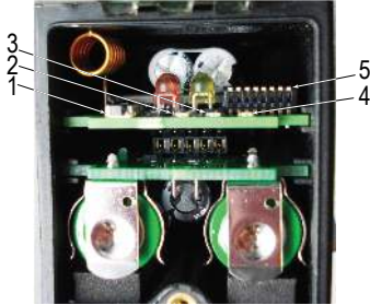
Figure 1. Inside the Q45