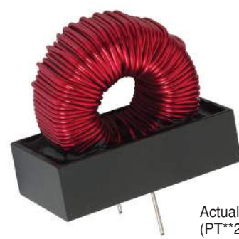
Actual Size (PT**25-894VM)