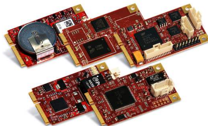
Mini PCIe Modules