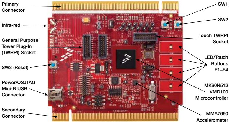
Figure 1: Front Side of TWR-K60N512 Module Not Including TWRPI.