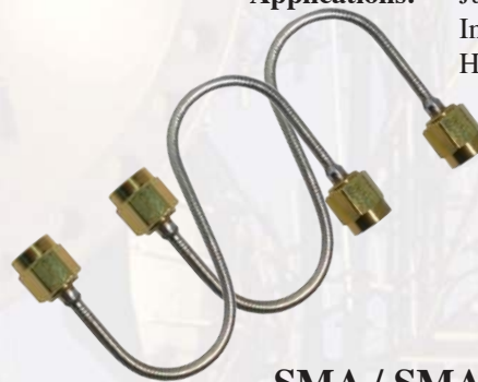
SMA / SMA [Straight/Straight]