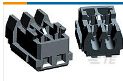
TE Part #353293-3 MINI CT MT REC ASSY 3P GRAY