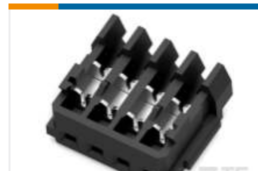
TE Part #2-353293-4 1.5MM CT MT REC ASS'Y 4P BLACK