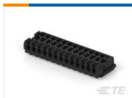
TE Part #3-353293-3 1.5MM CT MT REC ASSY 13P BLACK