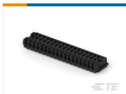
TE Part #3-353293-8 1.5MM CT MT REC ASSY 18P BLACK