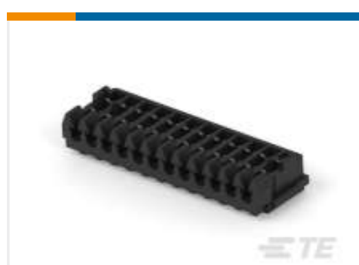
TE Part #3-353293-2 1.5MM CT MT REC ASSY 12P BLACK