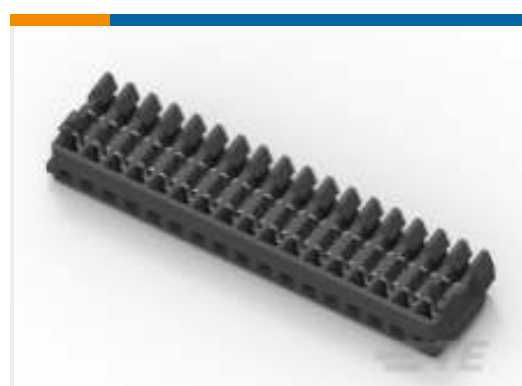
TE Part #3-353293-7 1.5MM CT MT REC ASSY 17P BLACK