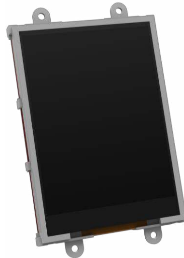
The uLCD-32-PTU Display Module