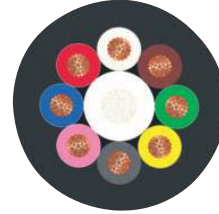
Cable cross section