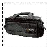
Soft Bag (optional)