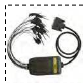
Logic Analyzer Module