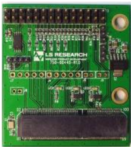
COM6L to BeagleBoard Adapter

The COM6L to BeagleBoard Adapter is designed for use with both the COM6L-T5 (TiWi5) Adapter Card and the COM6L-BLE (TiWi-BLE) Adapter Card.