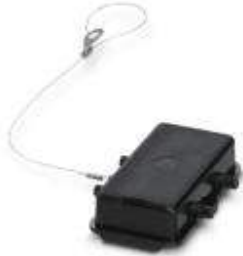
HEAVYCON protective cover, B10, for HC-EVO-B10... supporting base element, for double locking latch, with retaining cord with combination eyelet, IP54

Please be informed that the data shown in this PDF Document is generated from our Online Catalog. Please find the complete data in the user's documentation. Our General Terms of Use for Downloads are valid ( http://phoenixcontact.com/download )