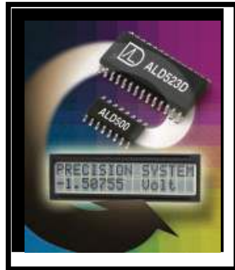
Chipset consisting of ALD500 Integrating Analog Processor and ALD523D Display Module Controller

In addition to the three modes of operation, up to three separate display group settings are available, each with different scale factors and UNIT displays. For applications such as embedded measurement instrument modules, up to three separate ranges of a single measurement can be preset, selected and displayed. Both software and hardware based settings are available for setting a variety of parameters such as Samples Averaging, Decimal Placement, Digits Blanking, Zero Level, Display Group Setting, Mode Selection, UNIT Labeling, and Calibration.