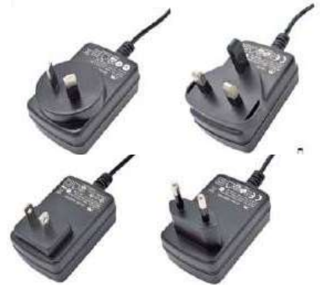
*Product images are for illustrative purposes only and may vary from actual design.