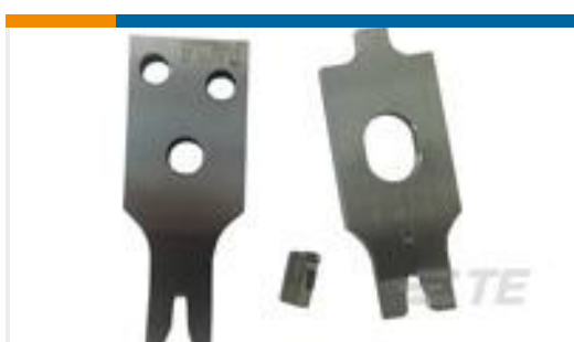
TE Part #7-2151265-7 OCEAN_2.0_SPARE_PART_KIT-042F0620