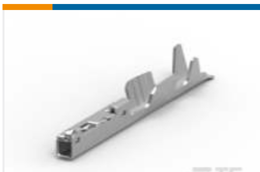
TE Part #2098583-2 Contact, 50 Series, fem, 0.35-