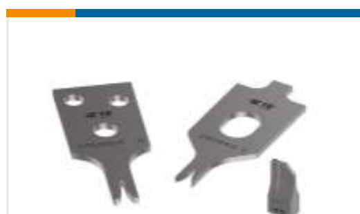
TE Part #7-2837428-7 OCEAN_2.0_SPARE_PART_KIT-062F0710