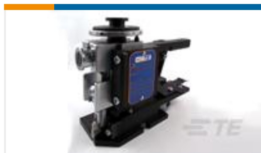
TE Part #2150343-1 OCEAN_2.0_Applicator-E-080F0900