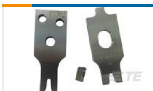
TE Part #7-2266165-7 OCEAN_2.0_SPARE_PART_KIT-055F0720