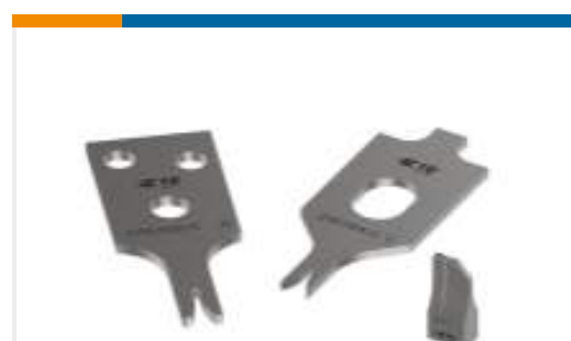
TE Part #7-2837655-7 OCEAN_2.0_SPARE_PART_KIT-073F0770