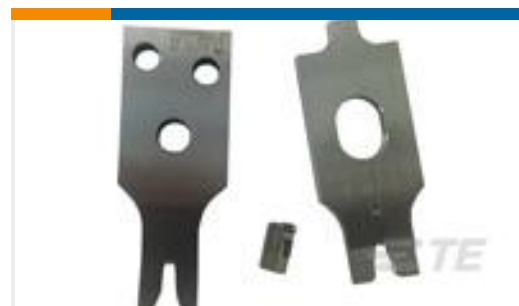
TE Part #7-2150343-7 OCEAN_2.0_SPARE_PART_KIT-080F0900