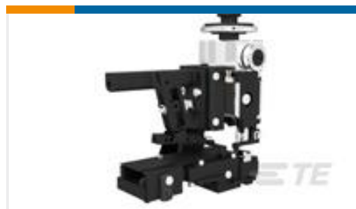
TE Part #2266165-1 OCEAN_2.0_APPLICATOR-S-055F0720