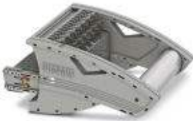
The figure shows the 14-pos. version

Test plug, With twist grip, Number of positions: 10, Width: 112.3 mm, Color: gray