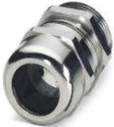
Cable gland, Cable gland material: Brass, nickel-plated, External cable diameter 34 mm ... 44 mm, Shielding: yes, Connecting thread: Pg48, Color: silver

Please be informed that the data shown in this PDF Document is generated from our Online Catalog. Please find the complete data in the user's documentation. Our General Terms of Use for Downloads are valid ( http://phoenixcontact.com/download )