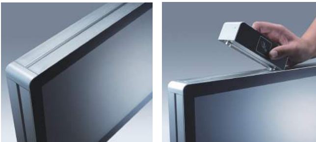
Side groove design for Flexible peripheral device